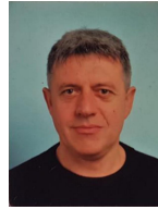
Para Taekwondo Classification Committee Member